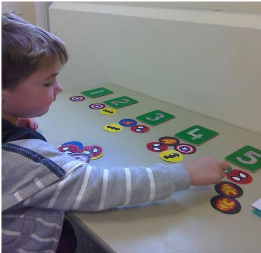
Matching number and quantity with counters or superhero emblems.

Some of the children are currently fascinated with numbers and number problems, so to encourage this we have provided different activities to further their knowledge and understanding.