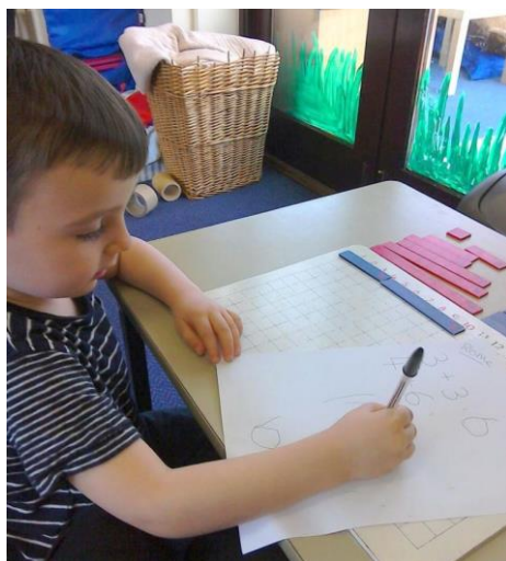
Using the Montessori addition strips to introduce simple addition and practising our number formation.