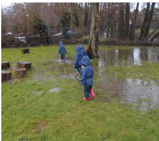
Splashing about in the flooded orchard!

March brought with it lots of opportunities to enjoy the weather and begin preparing the vegetable garden.