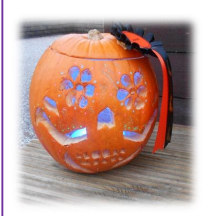
Staff winner - Rosie

We welcomed lots of families on Halloween to view the pumpkins displayed in the garden and share in some homemade pumpkin soup. The soup was made using the pumpkins the children had planted and grown in the nursery garden.