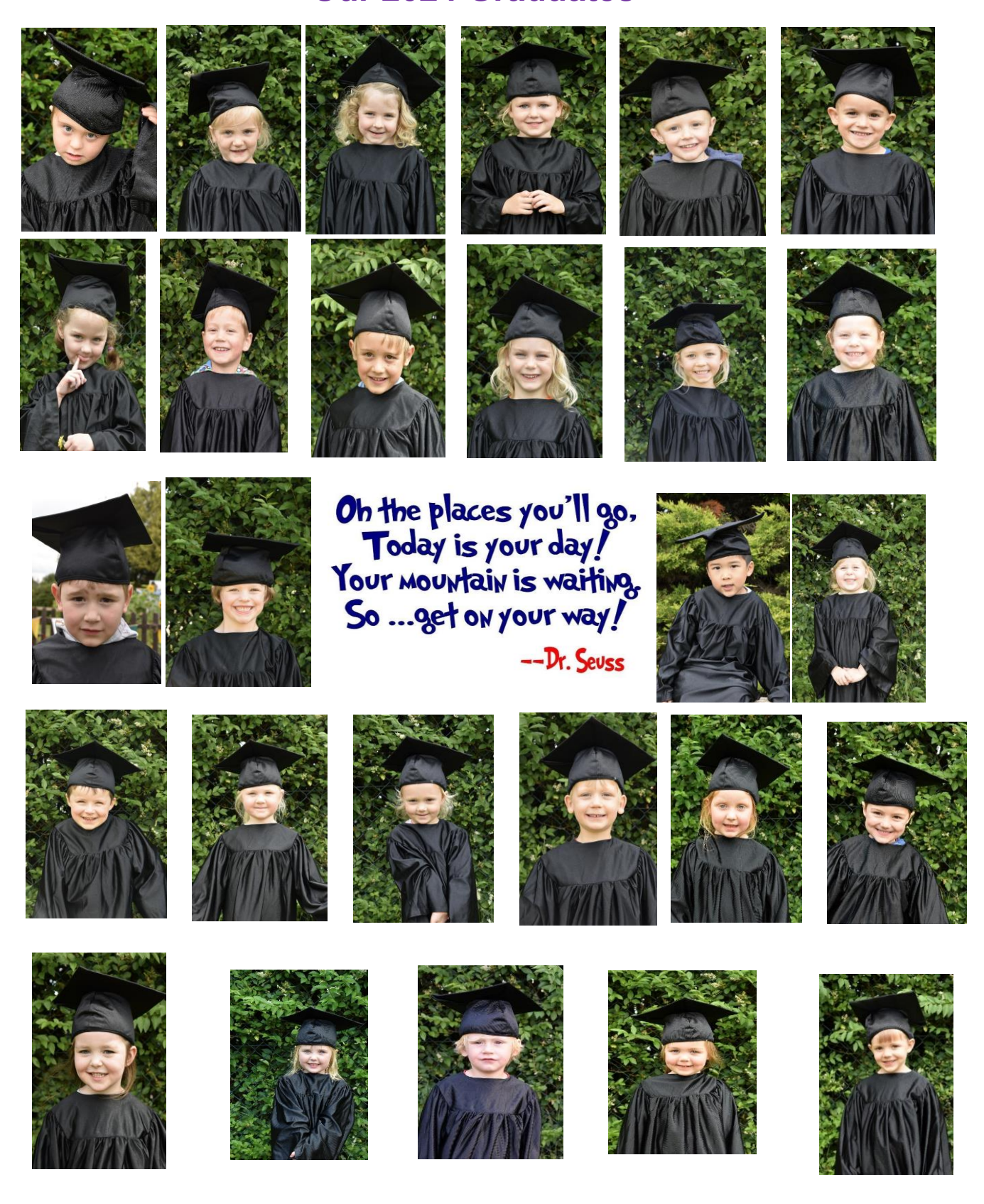
Wishing all our school leavers all the best in their next adventures!